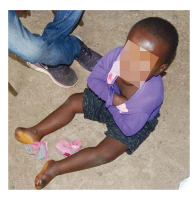
Visual deformities in children affected by leprosy indicate delayed treatment. Photograph taken during the author's visit to Sierra Leone (May 17, 2024).

Although the world has come a long way towards the elimination of leprosy, we have not reached our goals due to a whirlpool of negligence and poor political and social commitment. In many countries, leprosy continues to be a complex medical and social problem that adversely affects the lives of individuals and the community at large. As reported in the Weekly Epidemiological Record,<sup>1</sup> in 2023 there were 182,815 new leprosy cases detected globally, of which 10,322 were new child cases. When considering case numbers on the African continent, we must add data from seven countries in the Eastern Mediterranean Region (EMR)<sup>2</sup> to the African Region (AFR) totals, yielding 23,404 new cases, of which 1,731 are child cases and 3,183 involve grade 2 disabilities (visible deformities). These numbers are not just about instances of disease; they often also indicate that affected individuals are not enjoying their universal human rights and that they and their communities are grappling with various psychosocial problems.