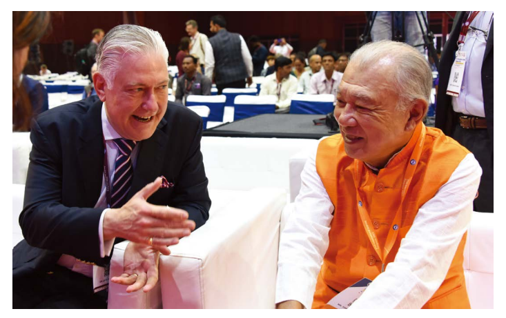
Dr. Lutz Hegemann of Novartis shares a moment with WHO Goodwill Ambassador for Leprosy Elimination Yohei Sasakawa before the opening ceremony of the 21st International Leprosy Conference (Hyderabad, India, Nov. 8, 2022).

According to WHO, the elimination of leprosy as a public health problem globally (defined as prevalence of less than 1 per 10,000 population) was achieved in 2000. Since then, we have seen control activities decline in most endemic countries. The challenges of leprosy elimination cannot be tackled by individual countries, sectors, or organizations. They can only be addressed through multi-sector partnerships, with shared visions, bringing complementary skills and experience. While partnerships are not always easy to create, they are the only way to create sustainable impact. We are proud to have worked alongside SHF for so many years on such a bold shared ambition as eliminating a disease.